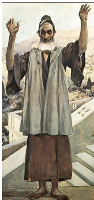
"Habakkuk" by James Tissot