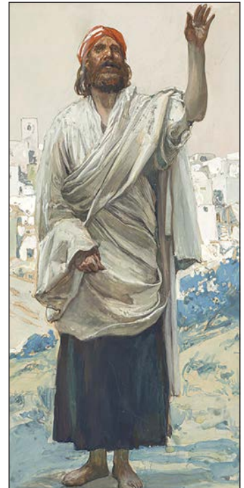
"Hosea" by James Tissot